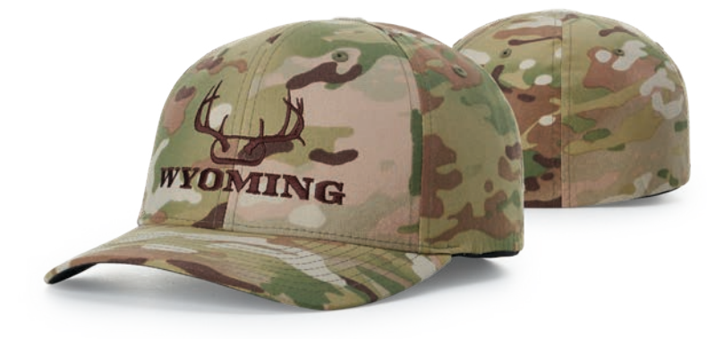
COLORS: Undervisor is Black.

FIT: R-Flex SIZE: SM-MD (7 - 7 1/4) LG-XL (7 3/8 - 7 5/8)