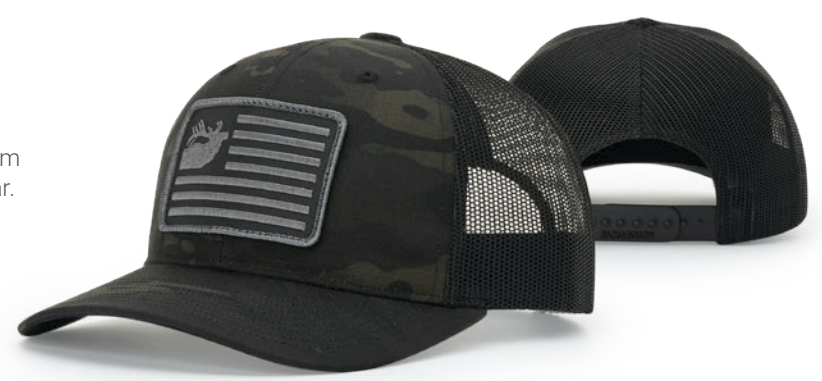
COLORS: Undervisor is Black.

FIT: Adjustable CLOSURE: Snapback SIZE: OSFM