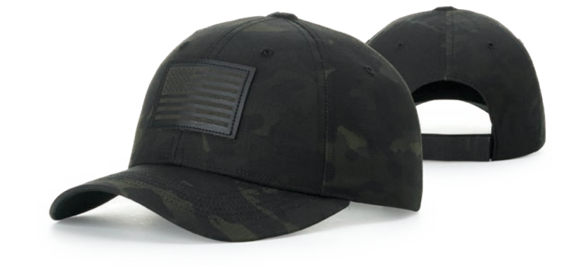
COLORS: Undervisor is Black.